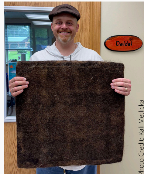
The Tribal Response Program (TRP) Coordinator shows off one of Matter of Trust's oil spill hair mats ("Harold").