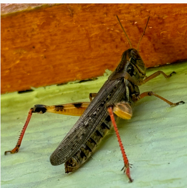
telt'uusi - grasshopper

Curious about the Tribal Response Program? Wanna talk about brownfields or have me do a presentation? Got an idea for an article you'd like to see? I'd love to hear from you!